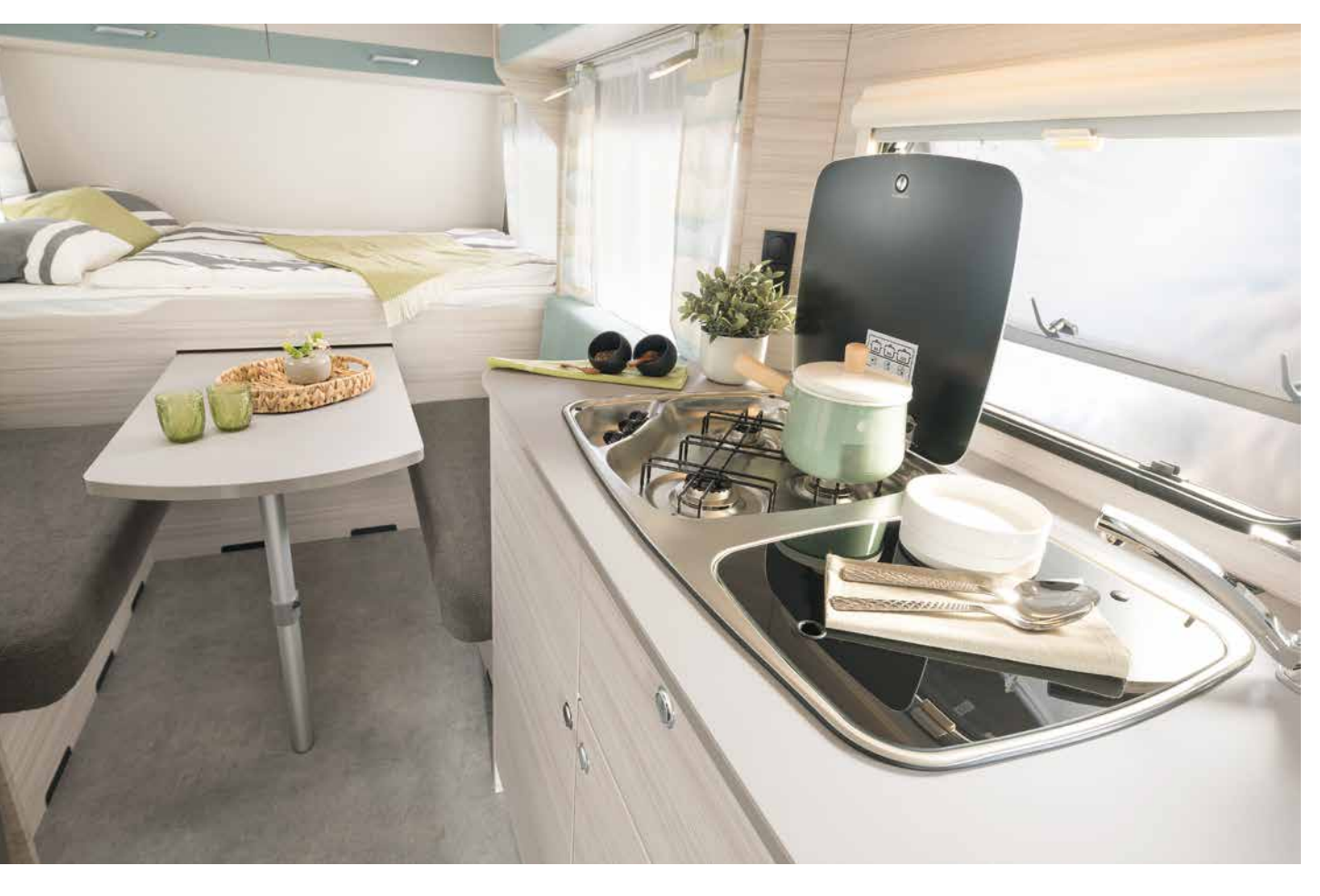
Compact and practical: with 3-burner hob, stainless steel sink and abundant storage space \cdot 480 QLK | Timor