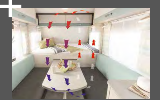
AirPlus – perfect air circulation in the interior with rear ventilation of the overhead lockers and sideboards