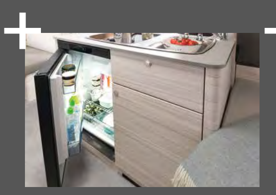
Compressor fridge as standard