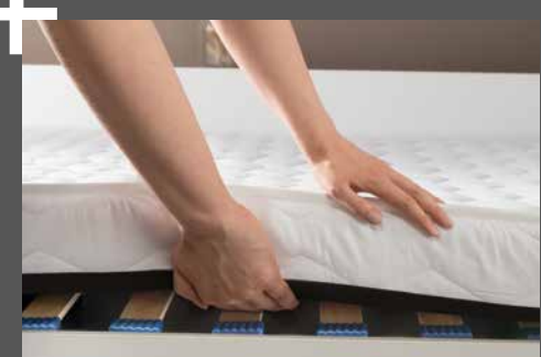
Cold foam mattresses as standard on all fixed single and double beds