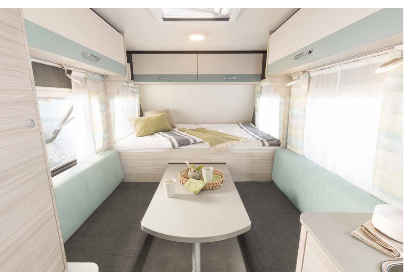
Practical: the seating lounge can easily be converted to a sleeping area • 480 QLK | Timor