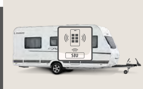
c'joy goes digital! The innovative SIU system (option) sends important vehicle information to your mobile phone! For detailed information see page 79