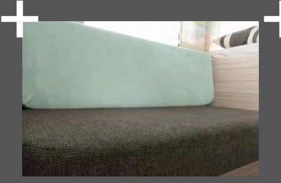
Sustainable fabrics made from 100% recycled PET bottles

You can find the full specification for the C'JOY models in the separate technical information or at www.dethleffs.com/cjoy