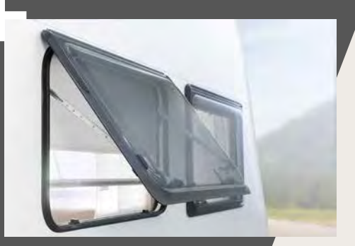
Openable and insulated double-glazed windows with blackout and mosquito blinds