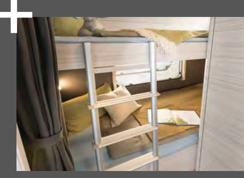
2-person bunk bed, optionally also available with a 3-person bunk bed (depending on layout)