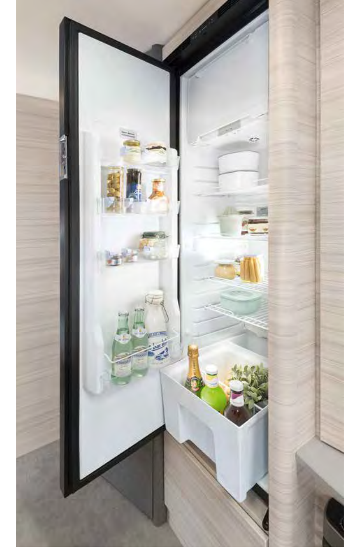
Many models include a large 131.5-litre compressor fridge with a 15-litre freezer • 480 QLK | Timor