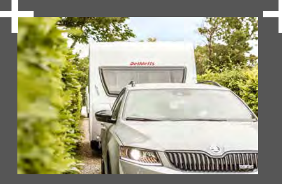
With a width of just 2.12 m, the c'joy fits through the narrowest passages