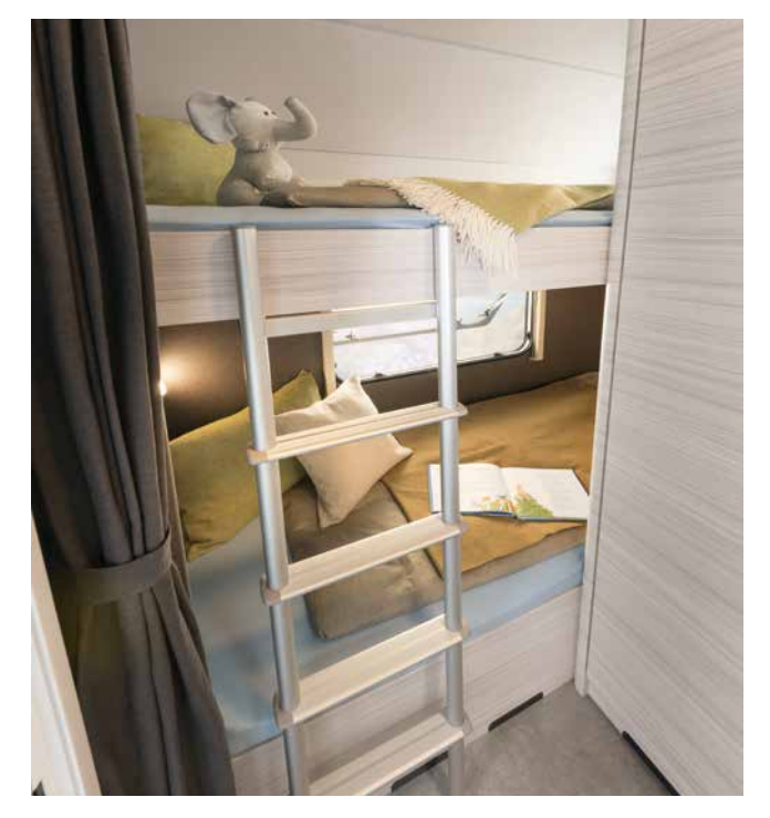
Up to three sleeping berths are optionally available in the bunk bed in the rear of the c'joy \cdot 480 QLK | Timor

Bonne nuit: enjoy restful sleep in a comfortable queen bed • 480 QLK | Timor