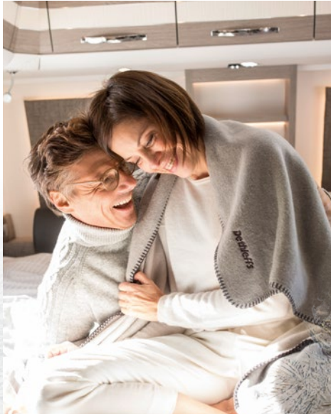
Enjoy constant, cosy warmth – just like at home