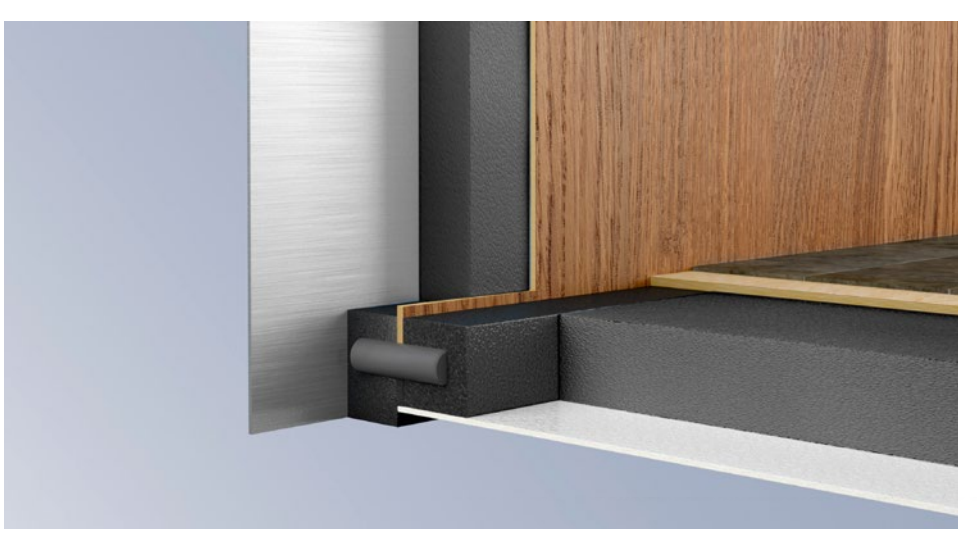
Well insulated: wall thickness 34mm, floor thickness 42mm

Our premium warm-water heating ensures even and comfortable heat distribution throughout the vehicle. As a fanless system it is ideal for allergy sufferers. Combined with the optional floor heating, it creates an optimal living climate, even for bare feet.