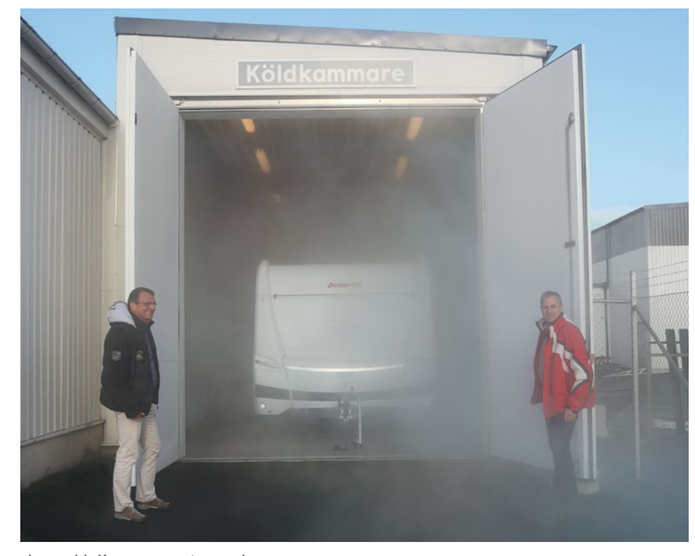
The Dethleffs test team in Sweden

"Suitable for winter use" means that, at an outside temperature of 0°C, the vehicle's interior can be permanently heated to 20°C. This is the case for all production vehicles from Dethleffs. For most manufacturers, "winterproof" describes a vehicle that complies with inspection level 3 of the DIN EN 1645-1 standard. This stipulates that it must be possible to heat a completely cold vehicle from -15°C to +20°C in just four hours.